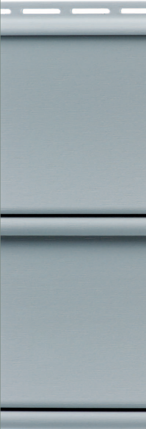
CHARLESTON BEADED COLLECTION® [6-1/2"]