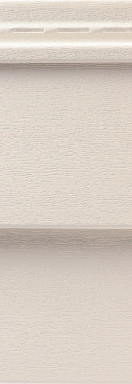
STRUCTURE® EPS INSULATED SIDING [D6"]