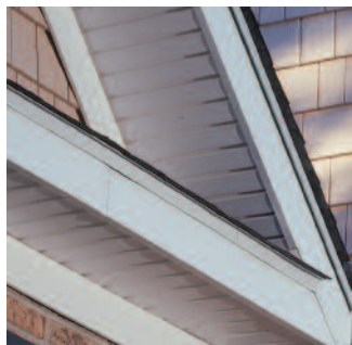
SOFFIT + FASCIA