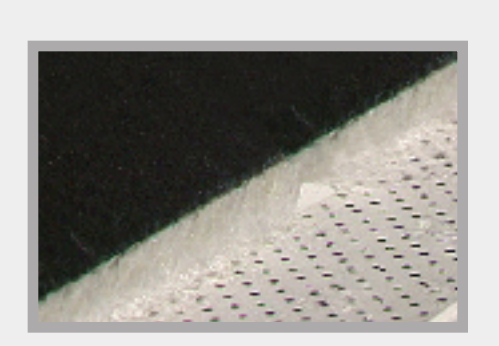
All tests have been performed by accredited independent laboratories, Intertek Testing Services NA Ltd and Architectural Testing.

Extensive research and development led to our exclusive Aluma-Perf<sup>™</sup> technology. The product has 489 perforations every 20 inches. This drains water at the same rate as a 2x3 downspout. Extensive testing proves that Leaf Relief<sup>®</sup> products can drain up to 32.9 inches of rainwater per hour; the highest amount of rainfall ever recorded was 12 inches of water per hour in Kilauea, Hawaii, in 1971.